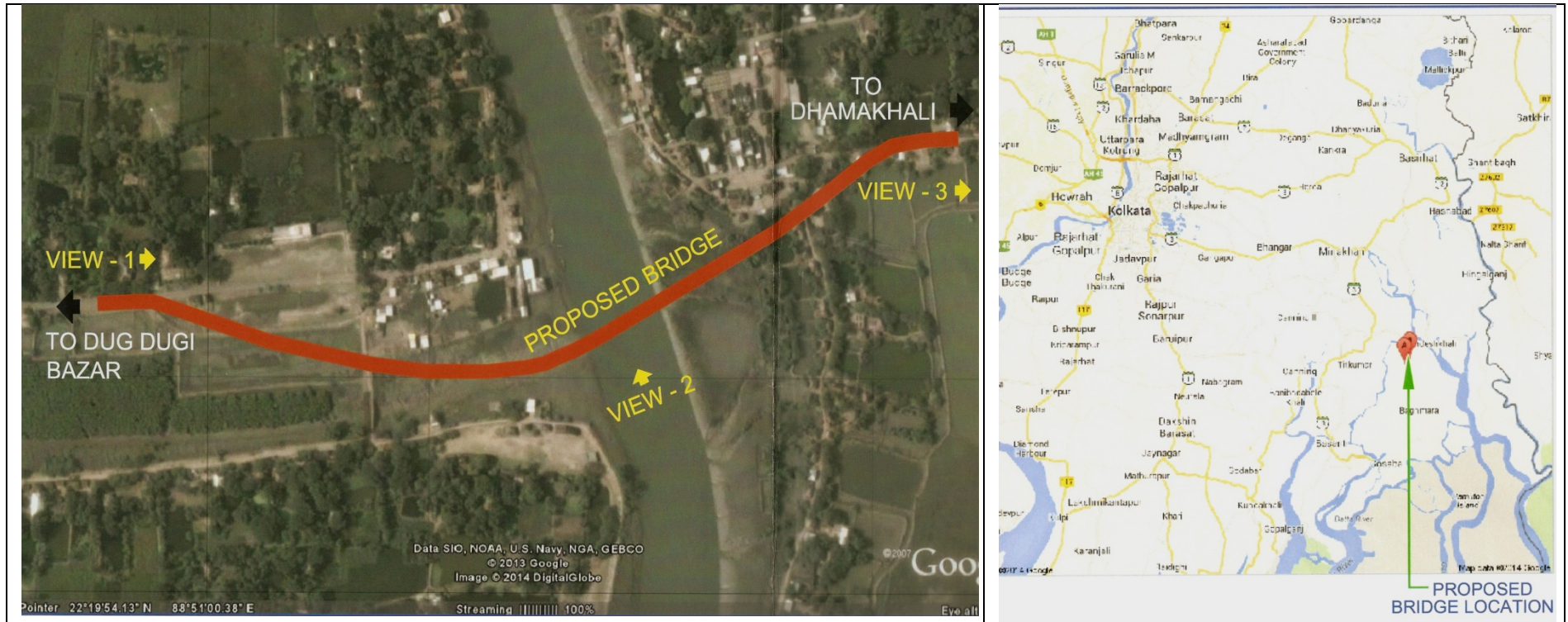
SITE PLAN SHOWING BRIDGE LOCATION