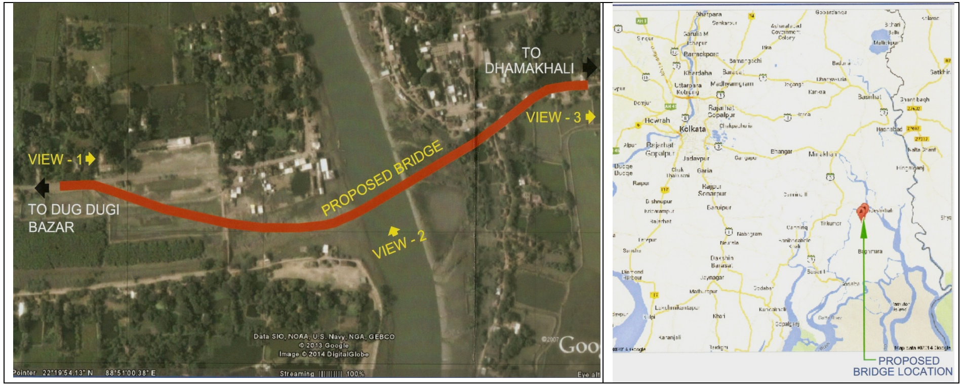
SITE PLAN SHOWING BRIDGE LOCATION